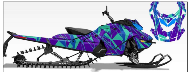
Dianne's new sled wrap. It's important to look good!