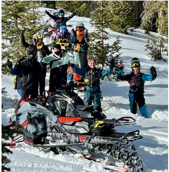
SJS Friends ride Wolf Creek